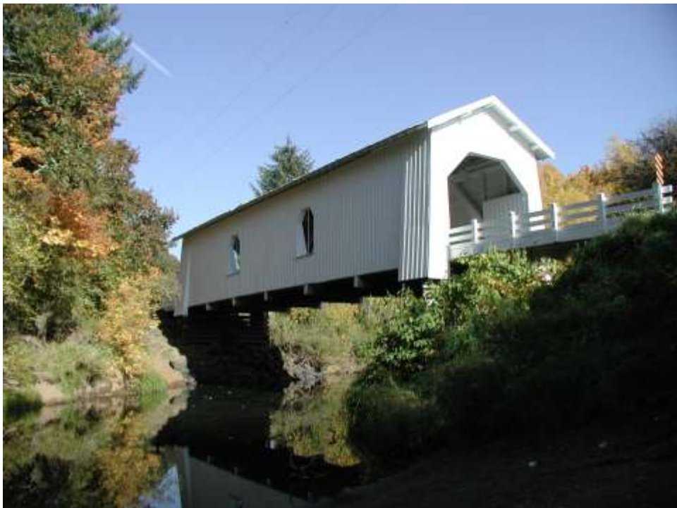
"Coming soon to a bridge near you..."